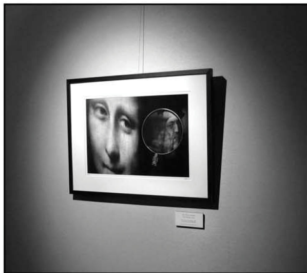
The Man Behind the Mona Lisa